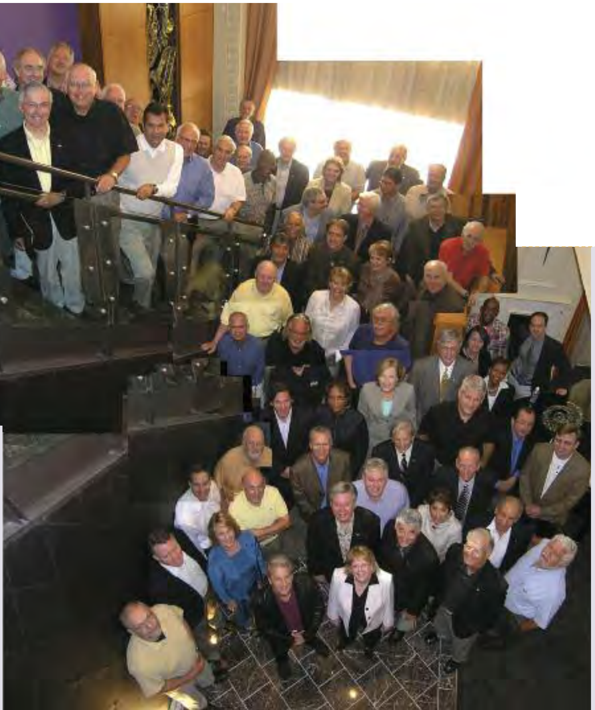
REPRESENTATIVES FROM 47 OF THE 54 NCARB JURISDICTIONS POSE WITH NCARB OFFICERS AND NCARB STAFF AT THE 2007 MEMBER BOARD CHAIRS CONFERENCE.