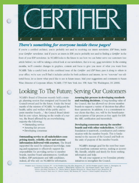
CERTIFIER, JANUARY 1998